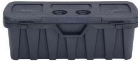
SUV Truck Box