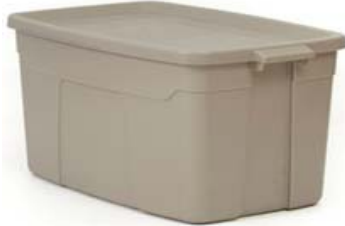
Simple Rubbermaid Container